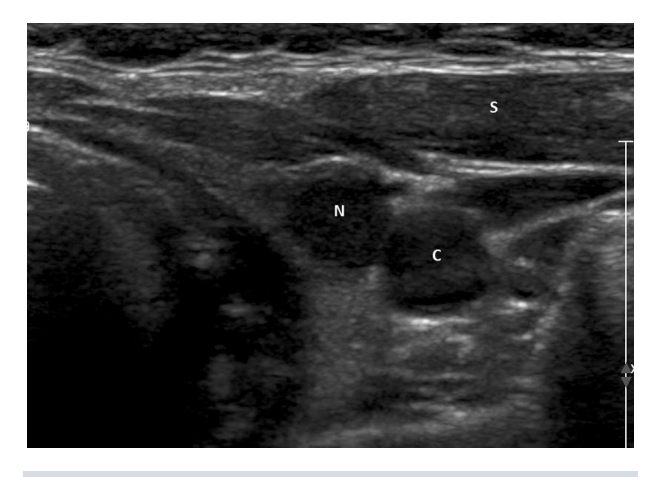
Fig 2C. Echogenicity. Very hypoechoic nodule: 55-year-old woman with 1.0-cm very hypoechoic left lobe nodule (N). Margins are smooth. Note that nodule is less echogenic than adjacent strap muscles (S) and essentially isoechoic to the common carotid artery (C). Diagnosis: papillary carcinoma. Figures 2A and 2B available online.

described relative to the adjacent thyroid tissue, but it may be noted that the background tissue is of altered echogenicity.