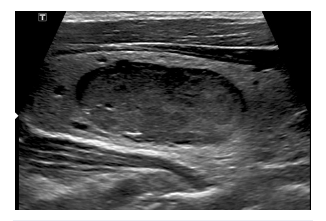
Fig 1A. Composition. (A) Solid nodule: 46-year-old man with 3.5-cm solid, hypoechoic nodule. Margins are smooth. Macrocalcifications were identified on other sections. Diagnosis: medullary carcinoma. Figures 1B to 1D available online.

• Spongiform: Composed predominately of tiny cystic spaces (Fig. 1D, online only).