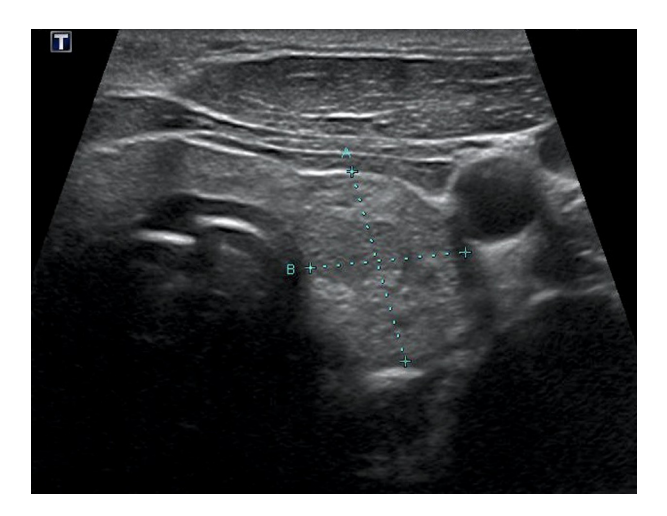
Fig 3. Shape: 56-year-old woman with taller-than-wide nodule in left lobe of thyroid. Dimensions measured in the transverse plane are 1.4 cm transverse \times 1.8 cm anteroposterior. Diagnosis: follicular variant, papillary carcinoma.

In studies that specify how measurements are made, there are no significant differences comparing transverse or longitudinal dimensions [20,23]. For simplicity and consistency, the committee chose the ratio of >1 in the